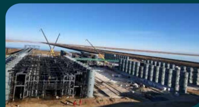
DLE from Brine