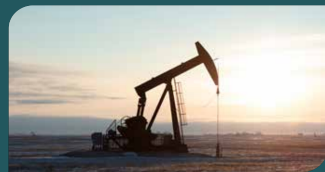
Lithium Harvest Technology

Lithium Harvest's proprietary DLE, augmented with sophisticated water treatment, transforms oil & gas wastewater into a valuable feedstock for the cleanest lithium. Our process not only delivers lithium to the industry faster and more cost-effectively than any other mining technology but also leads the market in eco-friendly extraction - a process that sets the global standard for sustainability in lithium extraction.