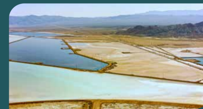
Solar Evaporation Brine Extraction