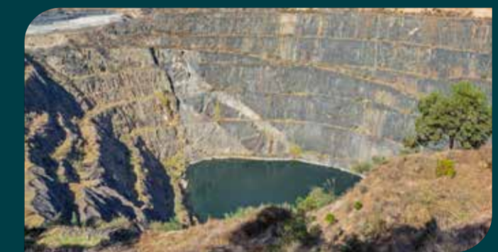
Hard Rock Mining